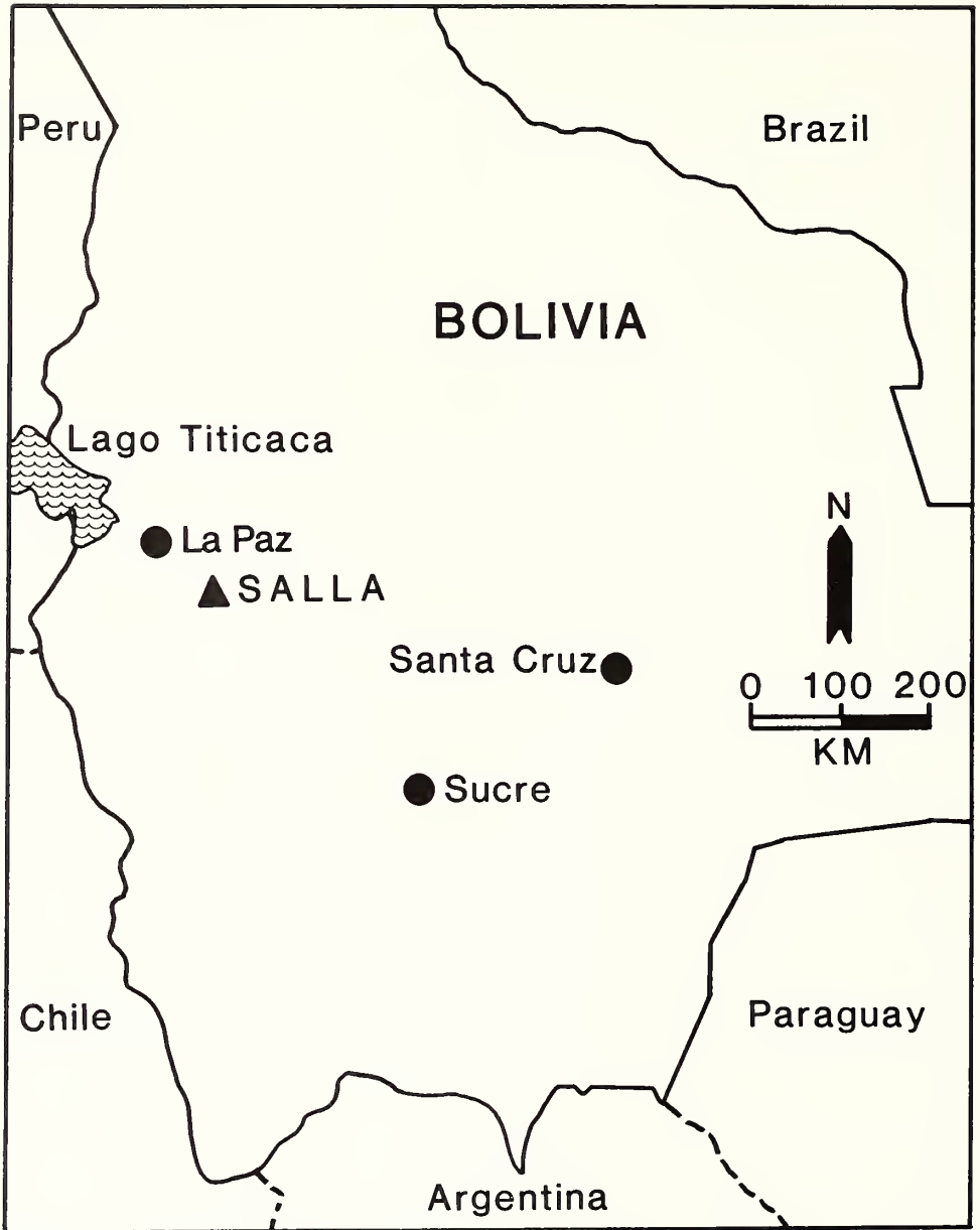
TEXT-FIG. 1. Location of the Salla Beds (triangle) of western Bolivia.